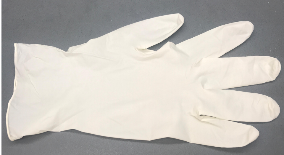
Photo : Latex Powder Free Gloves – (401200347), Size M